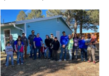
meet with a mentor each week. Carlsbad Church Street CON

One of the best things you'll receive from Christian Women's Job Corps is the opportunity to