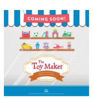
NDI-We are excited to announce a new

Vacation Bible School curriculum is coming soon. Stay tuned for more information!