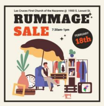
Las Cruces First CON Fund raiser for Youth Ministry