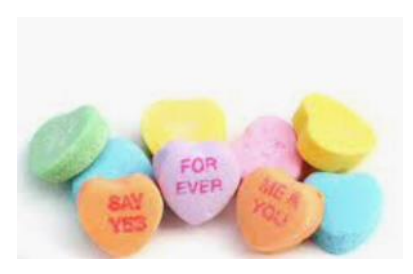
Valentine's Dinner and Game Night Feb 12, 2023